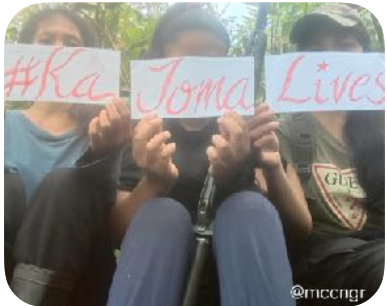
Red fighters from Negros Island celebrate Ka Joma's life, December 19, 2022

It is absolutely untrue that the people's revolutionary forces are dwindling and being defeated and that the Red cadres, commanders and fighters—all tested and tempered in more than 54 years of victorious people's war—are rapidly being killed or captured in focused military operations or surrendering because of such band-aid offers like the graft-laden Enhanced-Comprehensive Local Integration Program, Community Support Program and Barangay Development Plan. And yet the ruling clique and its military minions keep on demanding more public funds not only to attack the people but also to pocket the larger part of the military budget.